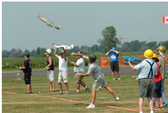
and join the Humber Valley Hawks combat team!