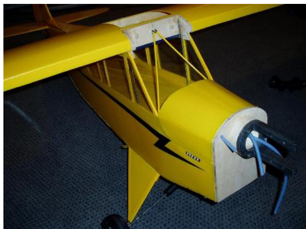
Cub is almost ready for the windshield installation.

"The Cub is nearing completion. Flight controls are now installed and the fuselage structure is complete. The toughest part of this project has been the design of the cabin / wing attachment. The full scale Cub has an enormous amount of window area below the wing. Most Cub models utilize wooden bulkheads that provide plenty of strength but do not look realistic. I've combined 1/8" fiberglass rods, steel threaded rod and piano wire to achieve an uncluttered cabin that supports the huge wing. The Cub will be powered by a .91 OS 4-stroke. I want to maiden it before the snow flies."