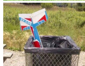
Left: Eric learns how not to perform low inverted passes!