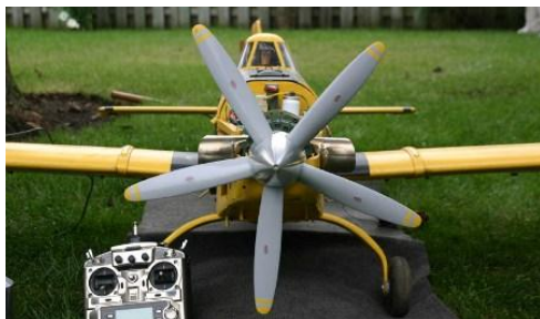
OK Smarty Pants! How do you balance this thing!

There are dozens of techniques and balancers out there. Some are simple, some complex, all ingenious. Bring in your equipment to demonstrate.