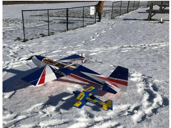
Airplanes of all sizes came out on New Year's Day

We had a picture perfect blue sky day for the New Year's Day Fun Fly but still only about 6 brave members showed up to fly. I guess there was a little more celebrating on New Year's Eve this year so getting up early was a bit of a challenge. Nevertheless we had a collection of airplanes - big and small that tested our ability to fly in cold weather. Hope to see you next year.