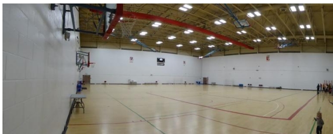
This panoramic view shows you how big our indoor space is!